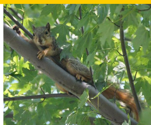
What a funny looking dog in a tree...