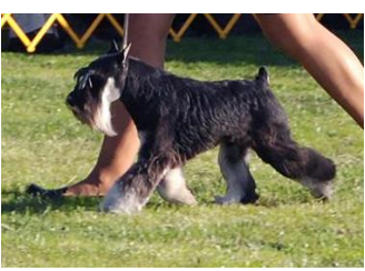
Before he became famous....