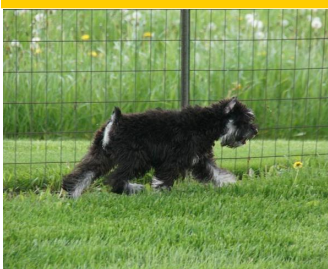
Places to go.....things to do.....