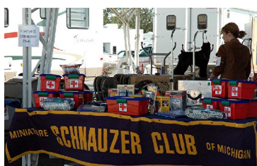
MSCM Trophy Table