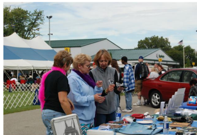
Great minds think alike....