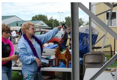
And the bidding begins!!!