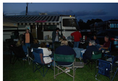
Saturday night party....wooo hooo!!!