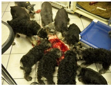
Blackwitch Buffet Open 7 Days

MSCM Christmas Banquet & Awards-Coral Gables Restaurant, East Lansing 4:00 p.m.