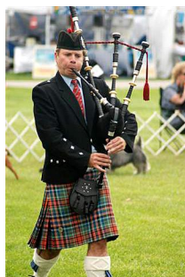
Opening ceremonies for the Terrier group judging