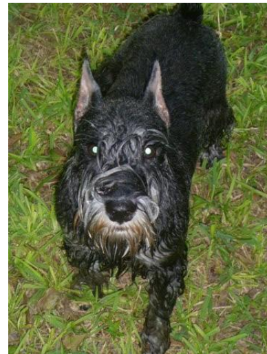
Boo...the Texas Water Spaniel

MSCM Christmas Banquet & Awards-Coral Gables Restaurant, East Lansing 4:00 p.m.